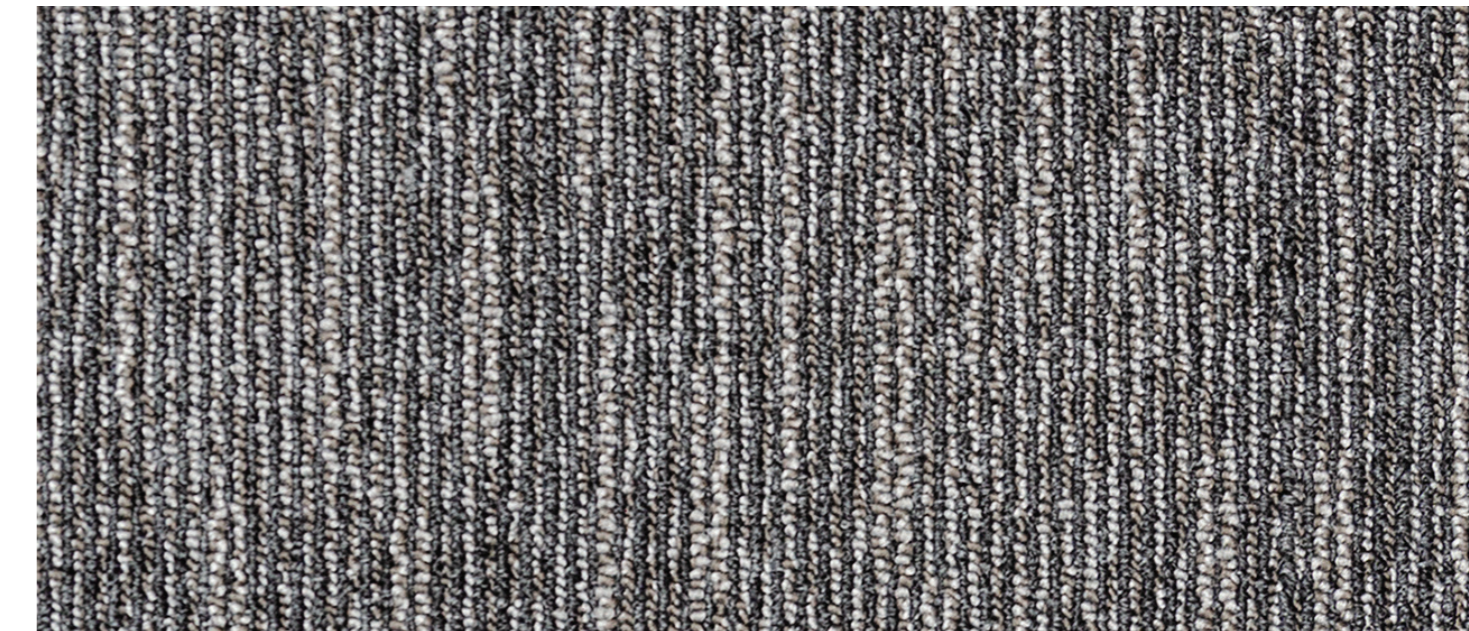
Cityscene | Granite 21 07505 | LRV 8.39