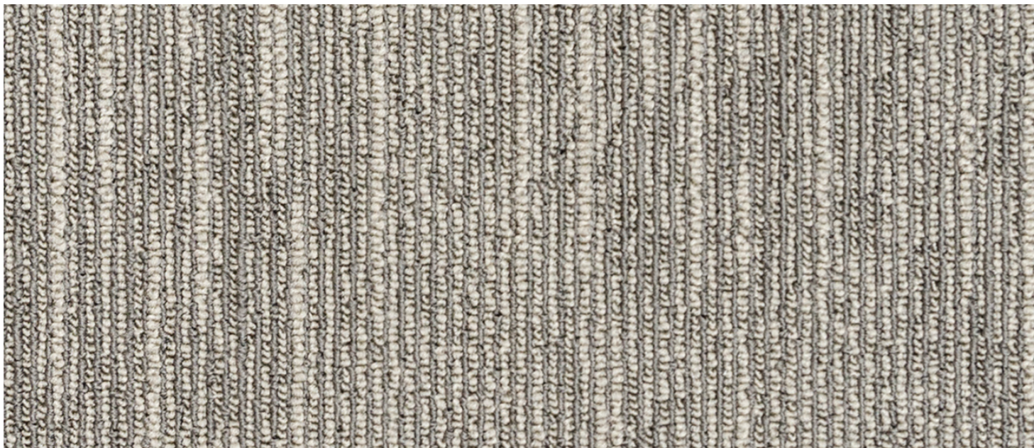
Cityscene | Tin 21 07501 | LRV 17.12