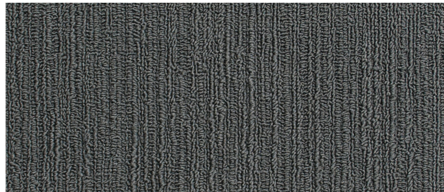
Brickworks | Tonbridge 22 06711 | LRV 4.49