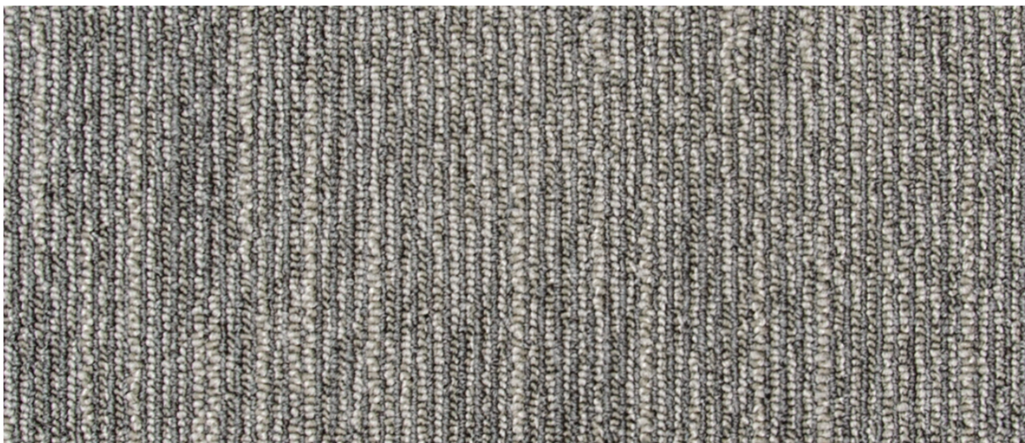
Cityscene | Claystone 21 07502 | LRV 12.54