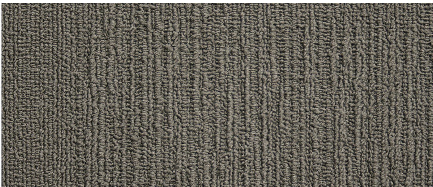
Brickworks | Ironstone 22 06707 | LRV 7.90