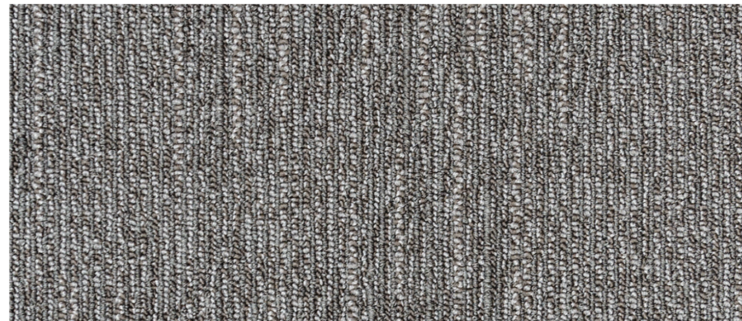
Cityscene | Rhyolite 21 07504 | LRV 9.92