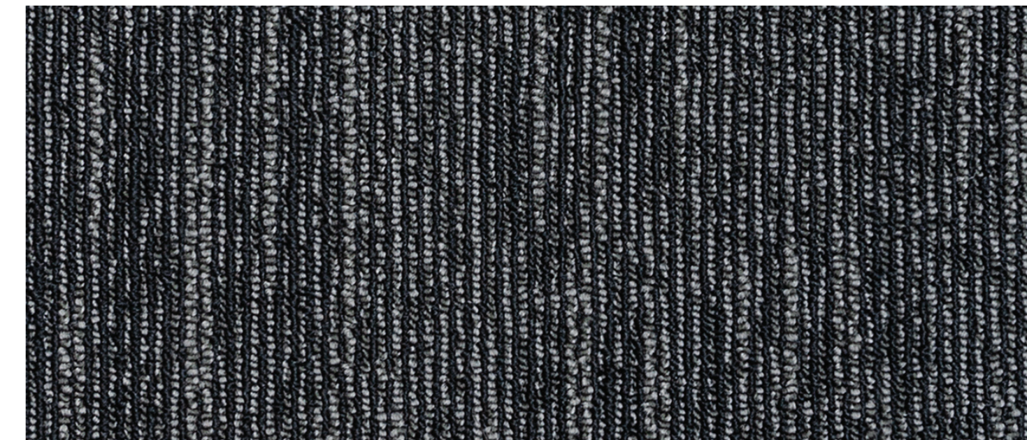
Cityscene | Basalt 21 07506 | LRV 3.25