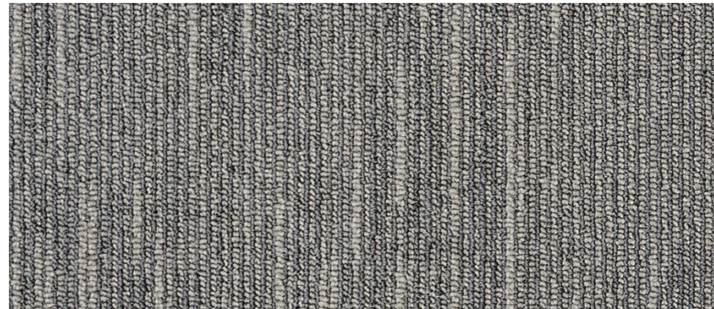
Cityscene | Shale 21 07503 | LRV 11.13